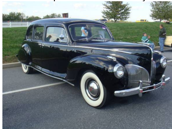
1941 Lincoln Zephyr Limousine at Hershey

While organizing and making arrangements for the upcoming Eastern National Meet in May, in Chattanooga, TN has most of the club leadership occupied, we are working also to arrange for collection tours in 2012 for visits in NC, SC and GA. Be sure to watch the website for information, as one is anticipated in late February!