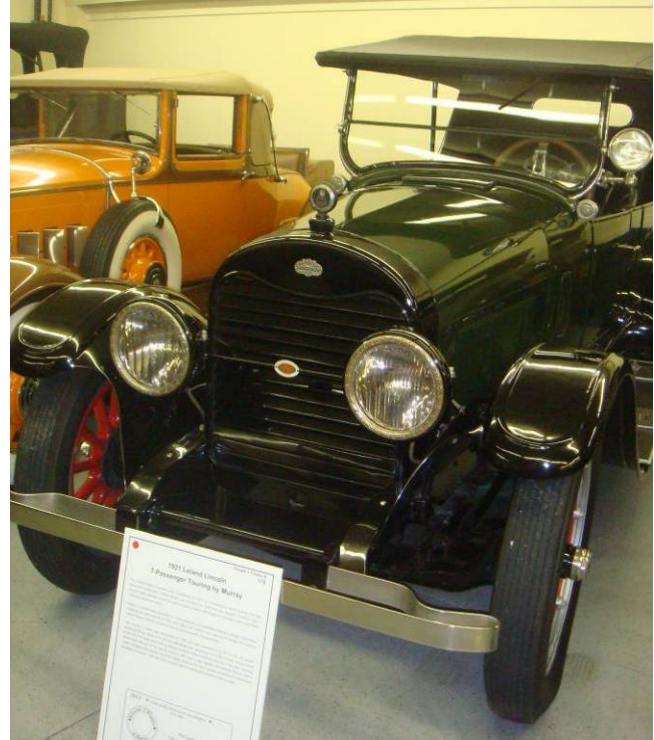
The oldest car in the Southern Region- 1921 Leyland Lincoln!