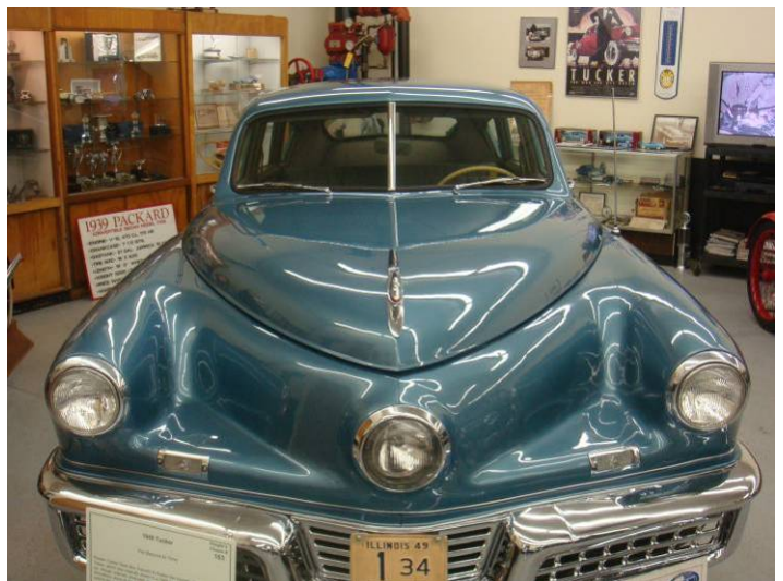
Not a Lincoln, but an incredible thrill to see, touch, and examine close-up a Tucker, one of the famous 51 made! Recently repainted, the mostly all original example is breathtaking.

The incomparable 1936 Lincoln Model K V-12 While members planned to attend that at the last minute let us know they could not, we selected this venue to be relatively central in the region—and will try again next year in November to do the same.