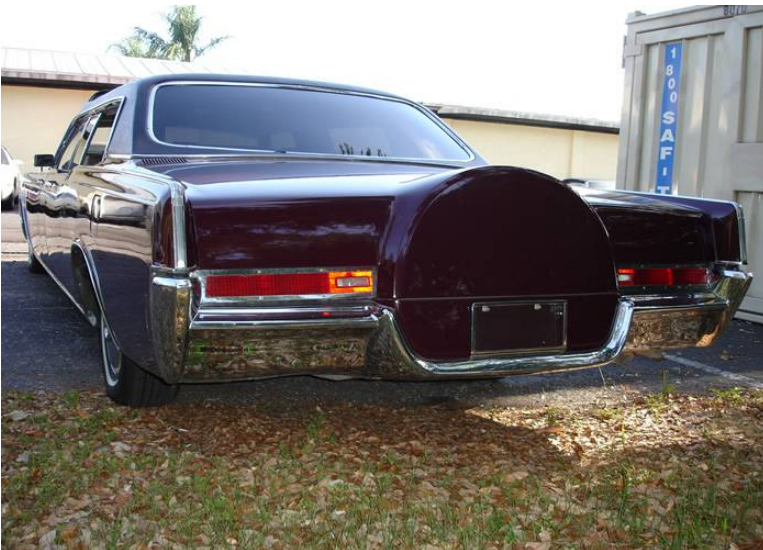
From the rear—continental spare better integrated than many ‘custom’ projects!

Jackie Gleason died in 1987. He is probably best known for the line “How sweet it is...” and Mr. Gleason, you left behind one sweet car for us to enjoy photos of today.