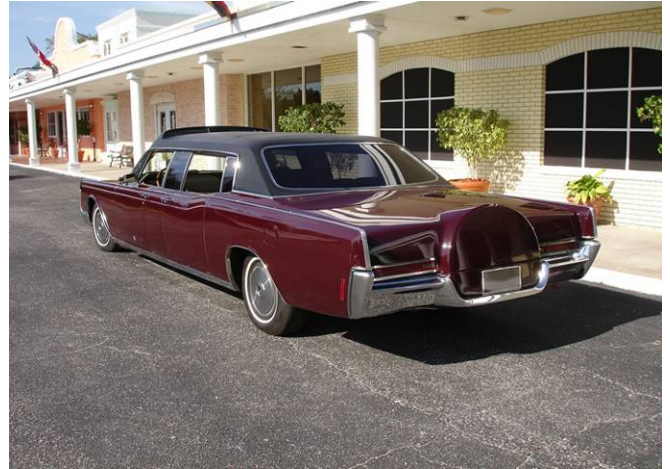
Certainly an odd roof flip up at the front, almost 1970’s rear roof side panel, and unusual rear window that doesn’t look like any Ford product. Bodywork appears to have been well executed.

Reviving his TV show in the mid- 1960’s brought him new fans—and shows in color (for those Americans lucky enough to have color TV!) Wonder what car commercials he had on there??