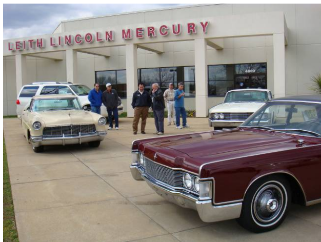
Southern Region Raleigh, NC Drive and Dine

Please renew your membership this month, and stay a vital part of the Southern Region. Let us know of activities you'd like to see in the Region—and the Board members will work to accomplish all we can to give our friends and members many opportunities in 2011!