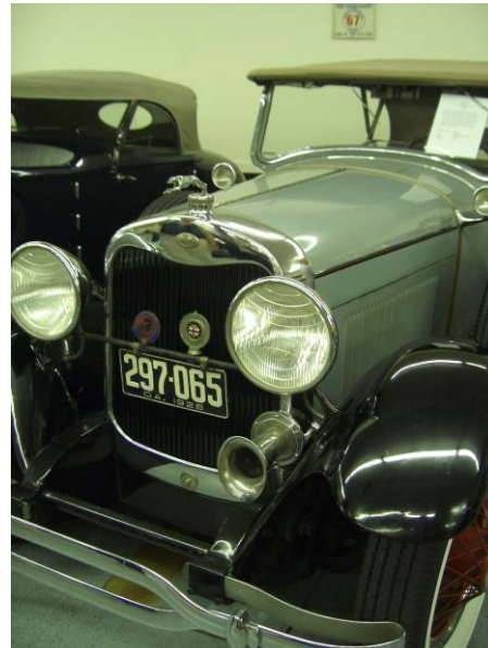
Southern region Cofer Collection, Atlanta

Please renew your membership this month, and stay a vital part of the Southern Region. Let us know of activities you'd like to see in the Region—and the Board members will work to accomplish all we can to give our friends and members many opportunities in 2011!