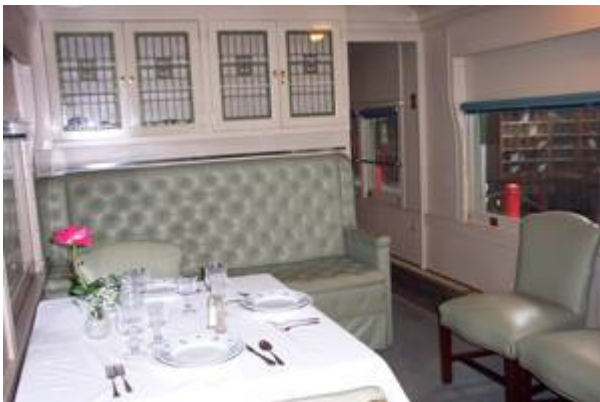
James B. Duke's private railcar on display at the Museum