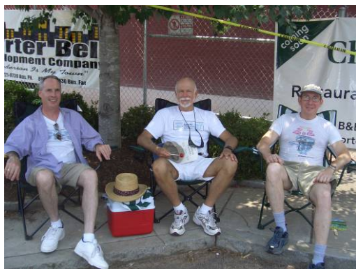
Southern Region Anderson, SC show

For only $ 15 our members receive what we hope is a good and informative newsletter, and notice of activities to attend--and issues that affect our hobby.