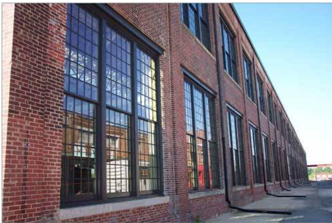
Spencer shops 'Back House' after restoration