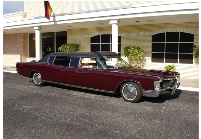
Maybe it’s just my preference, but a pair of the 68 deep ‘wire’ covers would be much more stylish than the mid- 70’s flat disc wheelcovers used—but it is a car befitting ‘The Great One’.